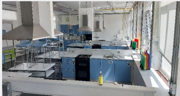
Home Economics Room